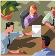
LFAPA is working for Louisiana's foster/adoptive parents